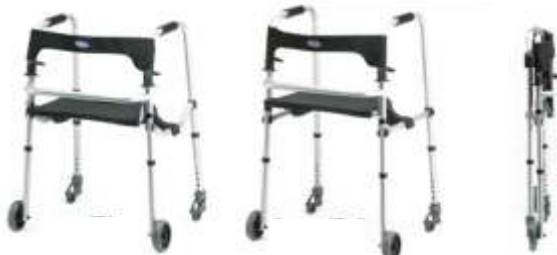
Model no. 6300-JRA (Junior to Adult)

Flip-up seat allows user to step inside the frame