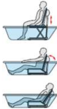
Lift in operation