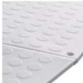
Can also be used without cover