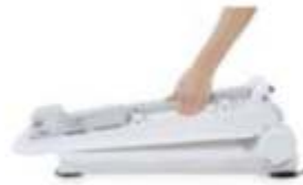
Can be disassembled into 2 parts