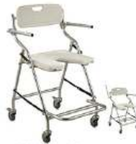
ALK405L-3" Shower Chair