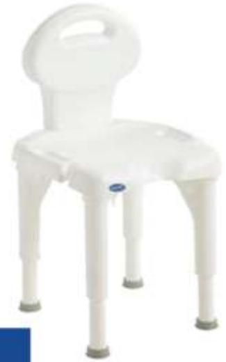
Invacare I-Fit 9781E