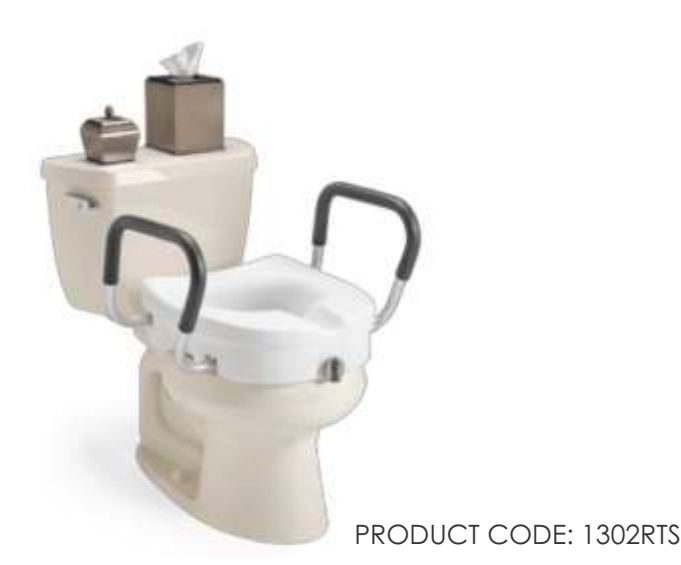
Invacare® Raised Toilet SeatModel no. 1301RTS without arms Model no. 1302RTS with arms (shown)