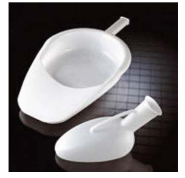
ALK001 Urinol PRODUCT CODE: ALK001