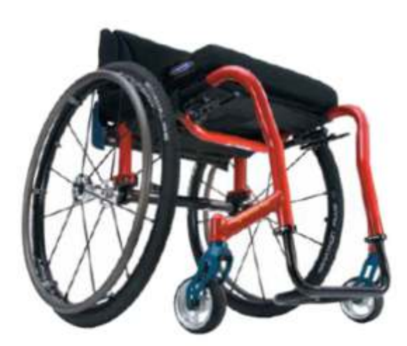
PRODUCT CODE: CRFS

it rear wheels 16" with 24" lightweight performance spoke wheel, bolt-on seat upholstery, mesh back upholstery with le tension, long seat support and 4" urethane caster.