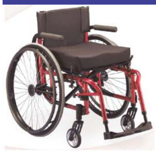
PRODUCT CODE: MVP