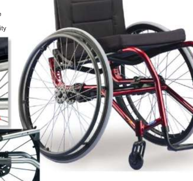
Forg Legs® front suspension forks absorb initial impact slowing vibration before it gets to the user.

E Adjustable-angle back standard for up to 15" of squeeze.