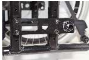
Rear Axle Close Up