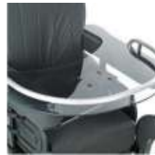
Table tray It is transparent and the rail offers gripping opportunities for posture solutions.

Tension adjustable backrest A new option adjustable in height and as wide as the seat.