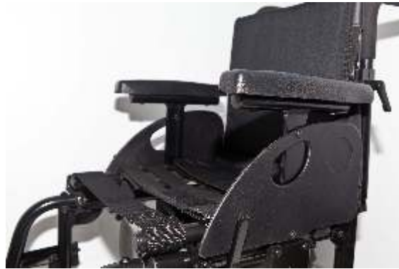
Seat Additional Strap