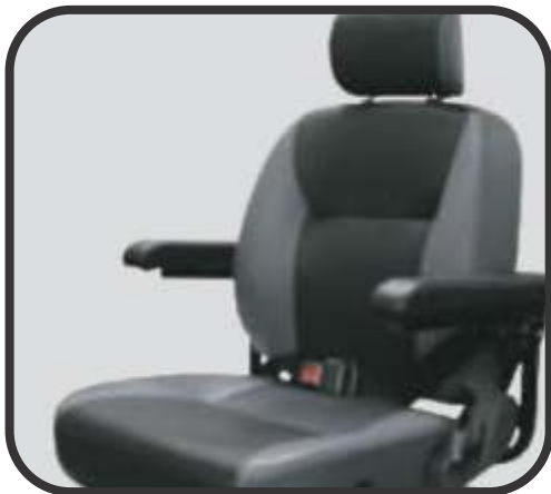
22" Captains Seat