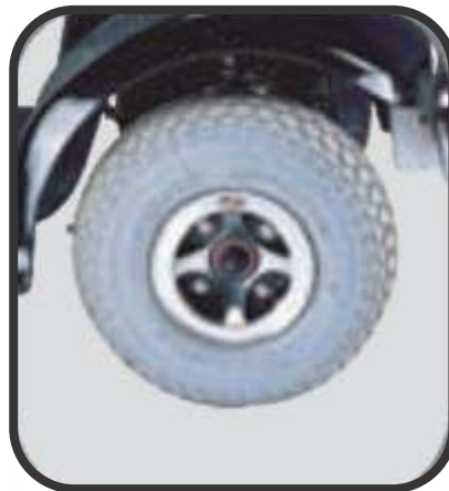
Flat Free Tyre