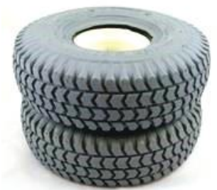
Solid Tyre Option