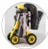
Small folding dimension for easy storage