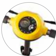
Easy-to-read control panel