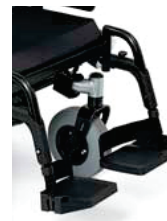
Swing in/out footrest The leg rests swing in and out for easy transfer and transportation.