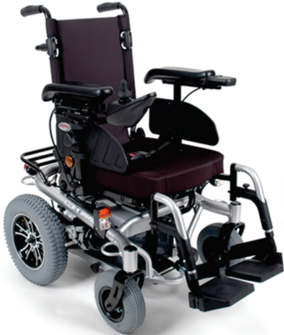
Lights & cushion not included