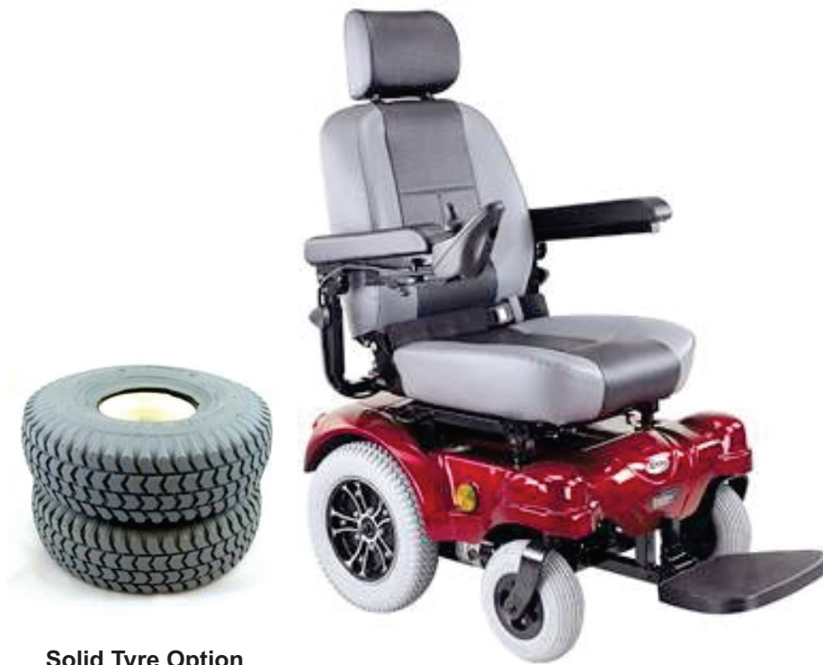
Solid Tyre Option