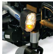
Light-kit Available as an option - includes bright headlights with indicators.