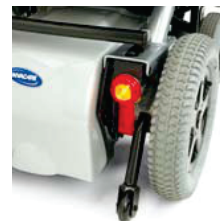
Rear wheels 14" pneumatic rear wheels with studded profile.